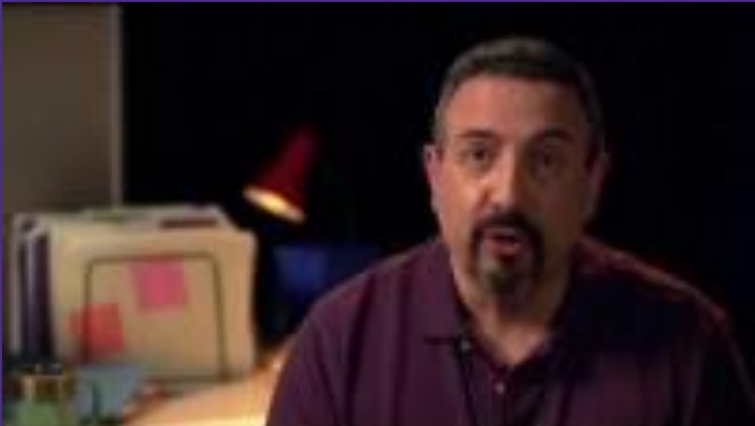
Boston College Active Shooter Awareness Video

This training video was made by a group Emergency Managers of the Boston Consortium for Higher Education and Yale University. The video was designed to be used by any institution of higher education.